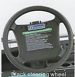
Black steering wheel